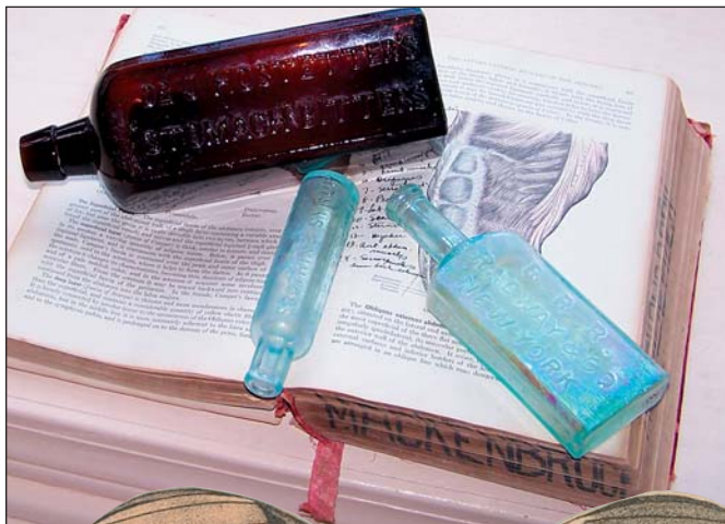
Left: You name it, it cures it: Dr. J. Hostetter's Stomach Bitters, Soothing Syrup, Rheumatic Liniment.