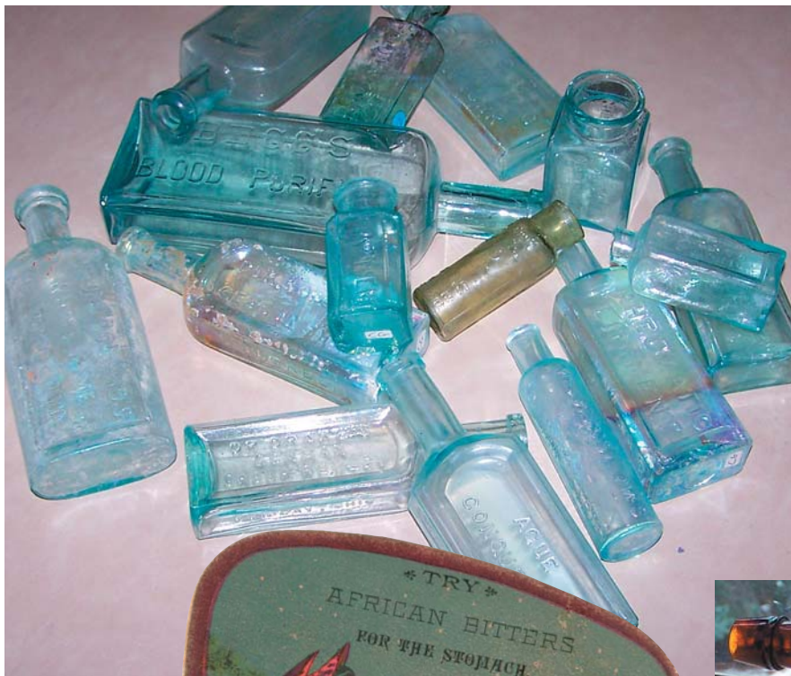
Left: Choose your poison: Ague Conqueror, Dr. Drake's German Croup Remedy, Rheumatic Liniment, Begg's Blood Purifier, A. Trast's Magnetic Ointment, Hamlin's Wizard Oil, Mrs. Winslow's Soothing Syrup or Sloan's Ointment.