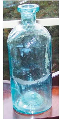
Above: Unembossed and having paper labels, "slicks" are the most common bottles found. Note the large pontil scar on bottom and air bubbles in this early example.