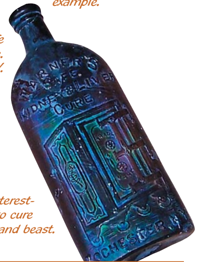
Left: An interest- ing claim to cure both man and beast.