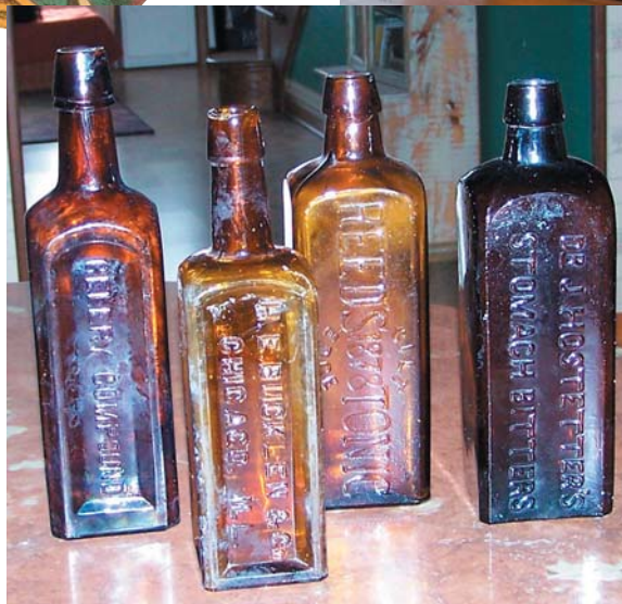
Above and Left: A collection of cure-alls: Reed's 1878 Tonic, Paine's Celery Compound, Dr. Hostetter's Stomach Bitters and Electric Bitters.